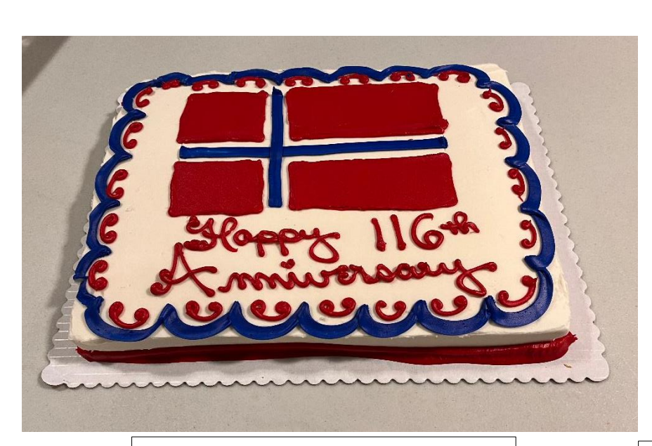
FOSSELYNGEN LODGE 116<sup>TH</sup> ANNIVERSARY CAKE