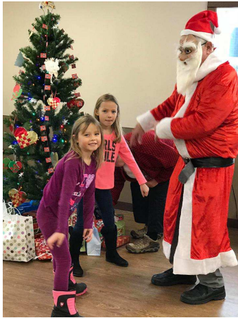
Well, lookie here! That's the Julenisse with some happy girls at the Juletefest in Dec 18.