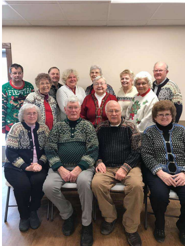
Everyone loves a sweater guy or girl, right? Members donned their sweaters for the December 2018 meeting.