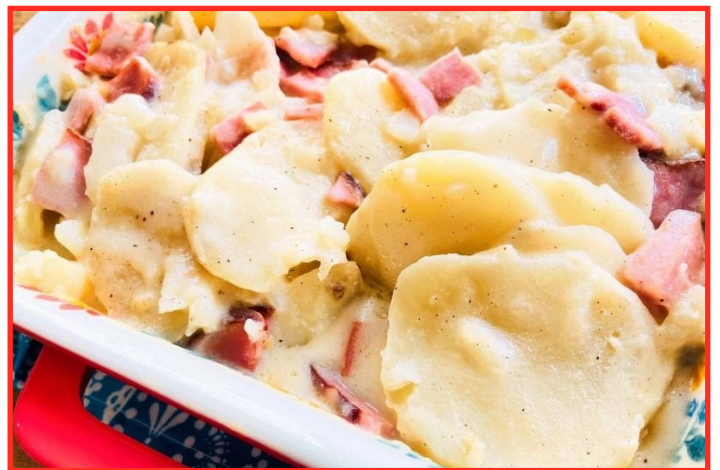
Royalty free stock photo

"It's just Potatoes and Diced Ham made with the Scalloped Potato Mix packaged at Menard's. Then I add Extra Cream and Butter."