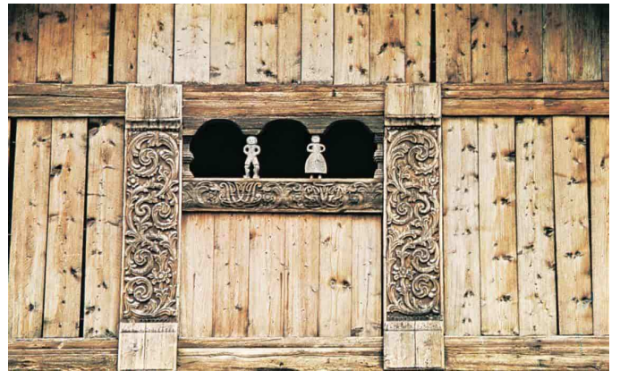
treskurd on entrance of a farm building in Kviteseid