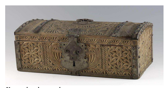
Karveskurd on a chest

Karveskurd likely originated in Norway as soon as people started carving wood. Geometric patterns are carved into the surface of the wood. A small knife is used to cut the pattern into the wood. Compass and ruler are used to create the pattern. Common patterns were roses with six or eight petals. This form of carving was found mostly at Vestlandet, but also in the coastal region south and north in Norway.