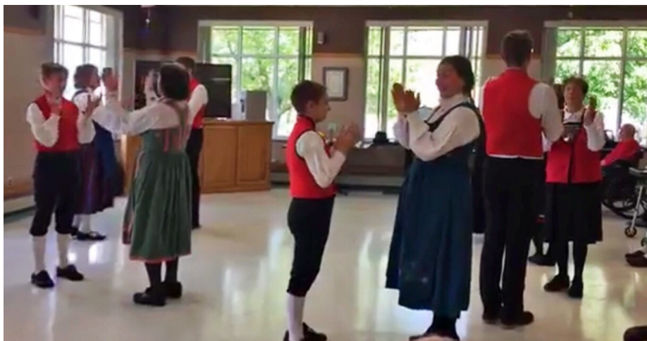
At left: The Wergeland Dancers performed at the Norseland Nursing Home in Westby on Sunday, June 2nd, 2019. Residents were very appreciative of the performance and hope they will come again.

Your whole family will enjoy delicious food, traditional crafts, a colorful parade, lively entertainment, sporting events, and our Saturday night fireworks display. Events begin with Thursday night's opening ceremonies at 6:45 pm, followed by two full days of fun activities for the whole family.