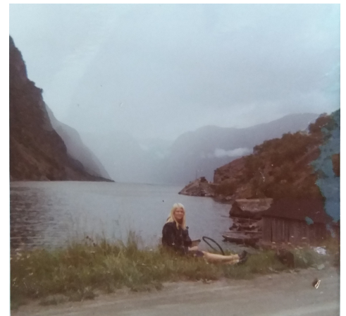
1970 photo of Presidenten Gail dreaming of adventures at the base of the Sognefjord, near Flåm, Norway