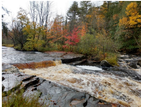
Upper Canyon Falls, Michigan's Upper Peninsula

Det er den draumen me ber på at noko vedunderleg skal skje, at det må skje - at tidi skal opna seg at hjarta skal opna seg at dører skal opna seg at berget skal opna seg at kjeldor skal springa - at draumen skal opna seg, at me ei morgonstund skal glida inn på ein våg me ikkje har visst um.