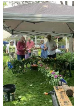
Decorating the Maipole. It took some effort and several of the children helped, although they are not pictured here.