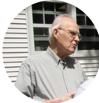
Ice Cream Social, August 2013