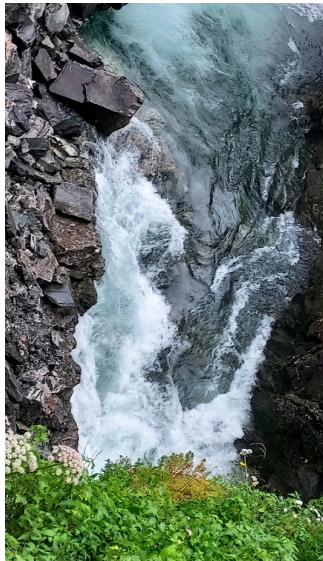
Nordfjord and sod roofs Massive waterfall in Flåm