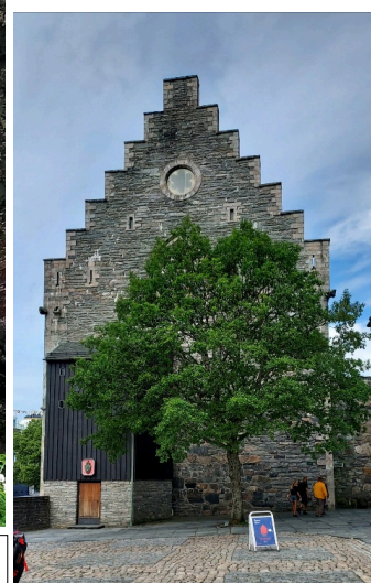
Typical farm flower garden Håkon's Hall in Bergen