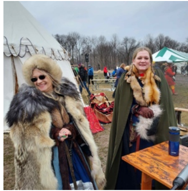
Viking sisters run Boffers game

I hope you will join us at the parade on Saturday, at our monthly meeting on Sunday, and at our language lesson in Marshall (or by Zoom) the following Wednesday!