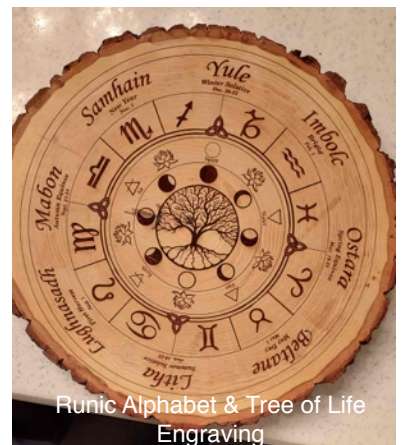
Runic Alphabet & Tree of Life Engraving