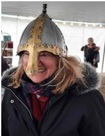
Viking Era Metal Helmet

I was particularly enthralled with the wide variety of animal skins worn by festival goers as well as those in the tents selling their crafts, metalwork, jewelry, clothes and food. The head of a taxidermist family explained to me that in Canada, rather than being an endangered species, wolves are considered pests to cattle ranchers and so are allowed to be shot and their warm, thickly-furred soft pelts are available for sale. Note his prize white wolf skin which he draped around my shoulders for a photo!