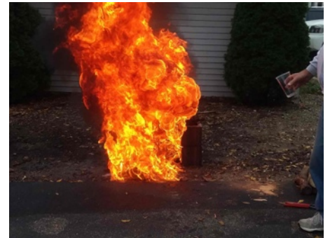
Vasa Fish Boil at Trinity Lutheran Church, 2018