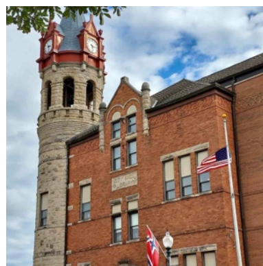
Stoughton Opera House