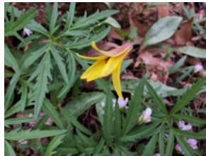
Yellow Trout Lily