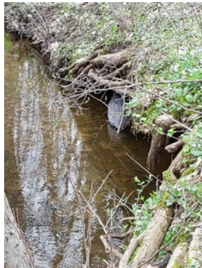
Great Blue Heron hiding in the West Creek