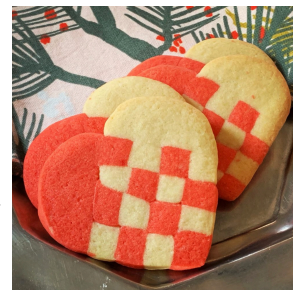
The 2nd Sunday in February is Mother's Day in Norway. Happy Mother's Day to all the mothers out there.