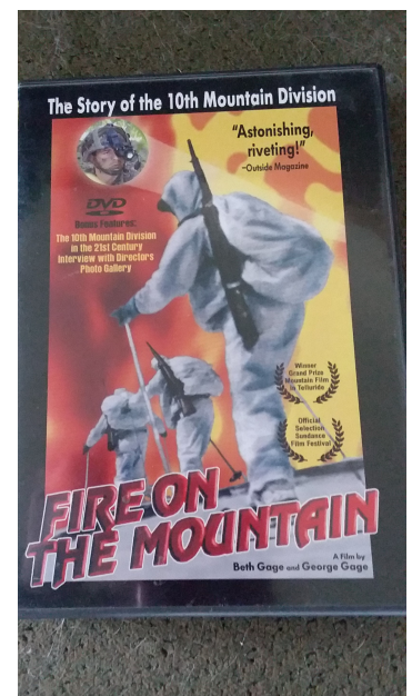
Fire on the Mountain film with "Winter Whites" of Ski Troopers.