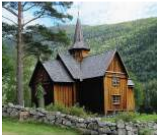
Nora Stave Church

Stave churches are an iconic part of Norway's cultural identity. A surviving testament to Medieval European architecture, Norway's most popular stave churches receive thousands of visitors each year. Yet, three of the country's lesser-known churches may be facing closure or sale this year due to financial hardship.