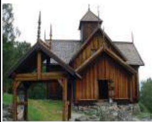
Uvdal Stave Church