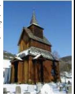
Torpo Stave Church