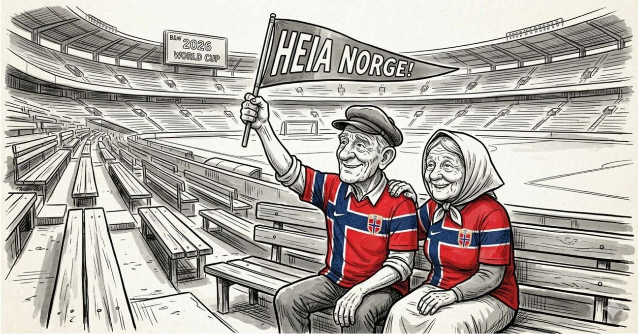
Ole & Lena are ready for some FOTBALL . Are you? See Pages 4 & 5 Heia Norge! (GO NORWAY! - Pronounced: Hey-ah Nor-geh)