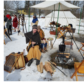
Left to right: Ceremonial burning of Viking ship; Vendor tents of Viking era wares; Vendor of fur, beads, woven work; Drop spindle wool spinning demonstration.