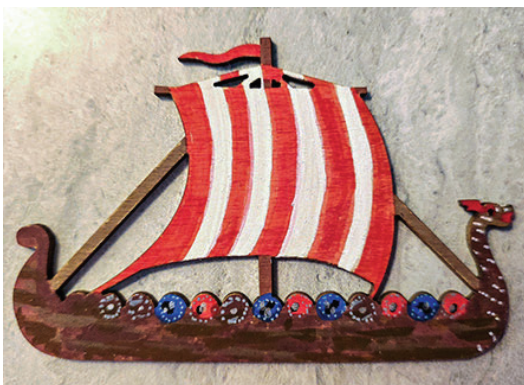
One of many viking ship ornaments being prepared for Midsummer at Chellburg Farm.