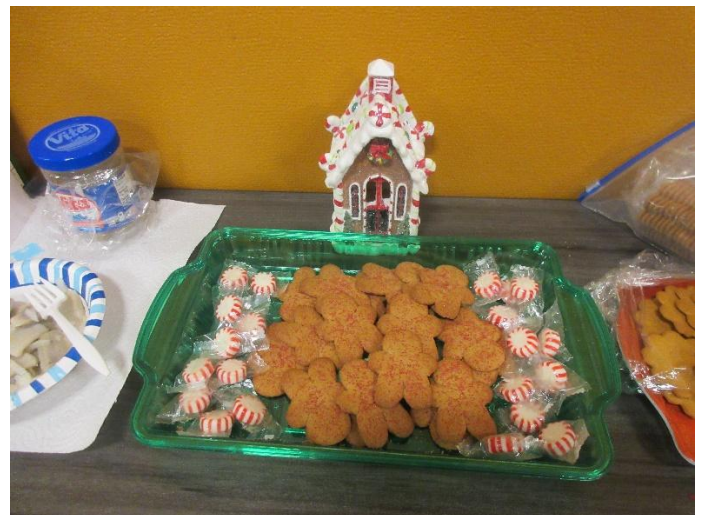
Ginger snaps and house