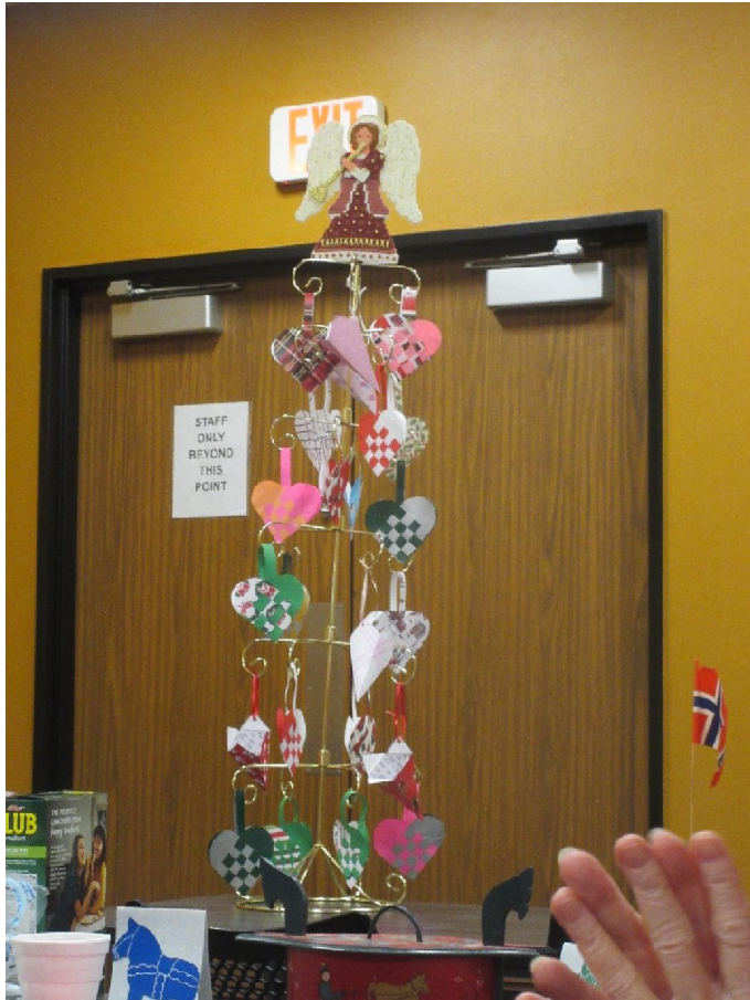
Sue Strohkirsch's paper ornament Christmas tree