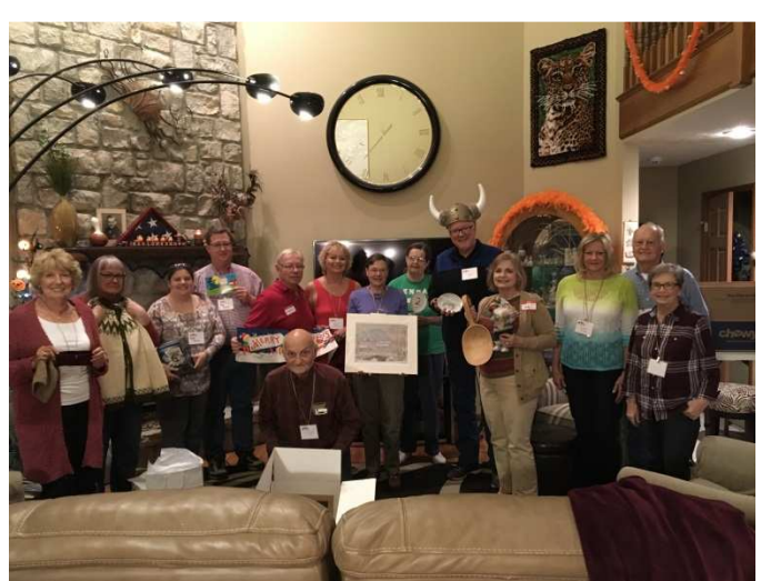
Fall Dinner and Auction attendees

In October, our lodge auction for the Foundation raised over $400 which will be sent to the International Office in Minneapolis to be used towards scholarships, grants, and humanitarian aid. Tusen takk to those who donated items or $$, to all of you who attended and brought new or gently used items, and to all who were winning bidders! There were handmade knitted items, lots of unique items donated from or purchased in Norway which provided nice bidding competition, some things old or new...! If you missed it this year, join us in the fun next year and bid for a great cause.