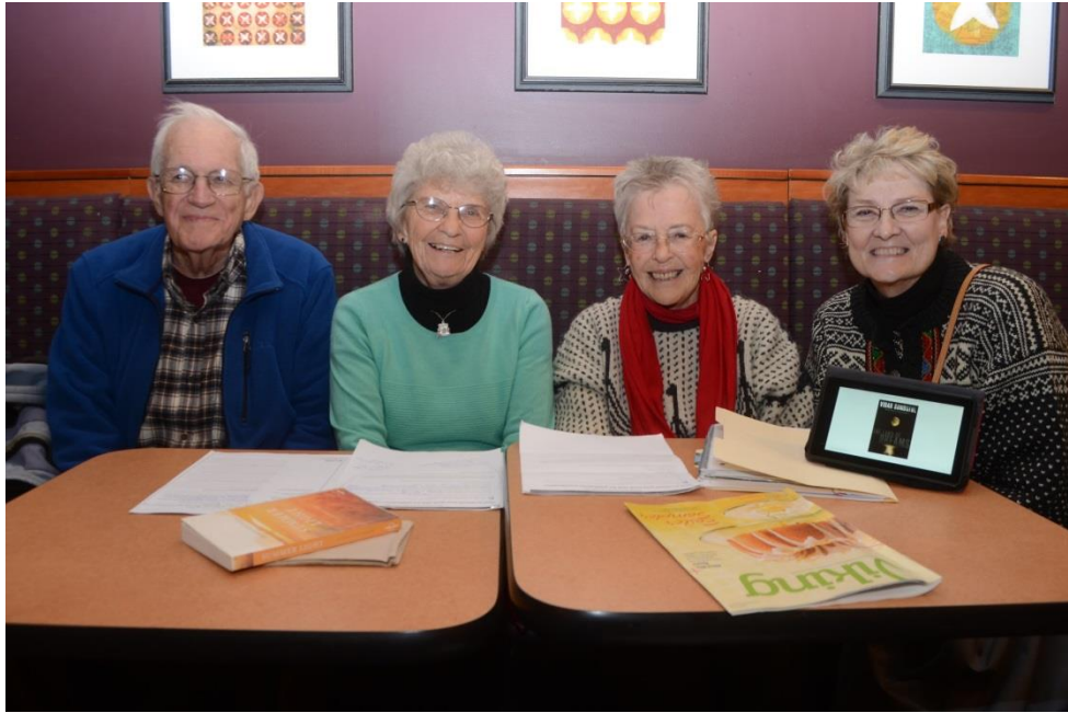
Polar Star Book Club Meeting Poetry Lodge Meeting