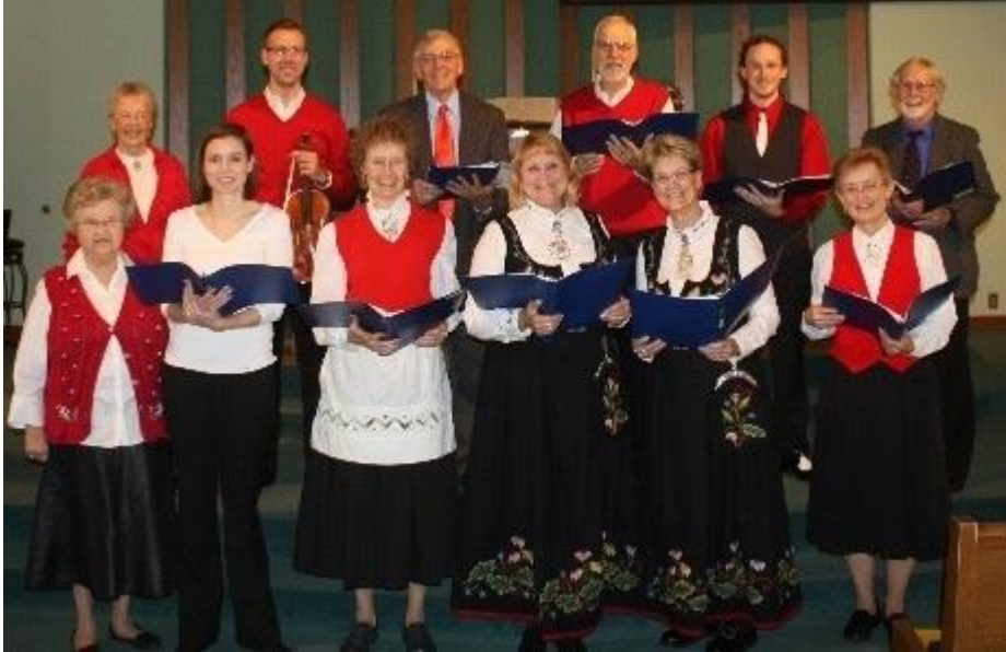
FOX VALLEY NORWEGIAN CHOIR