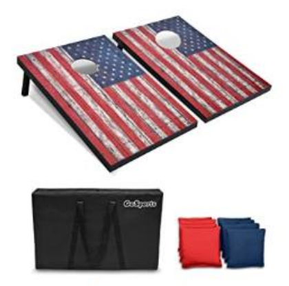
GoSports Classic Cornhole Set -Includes 8 Bean Bags, Travel Case and Game Rules (Choose between American Flag, Football, Rustic,