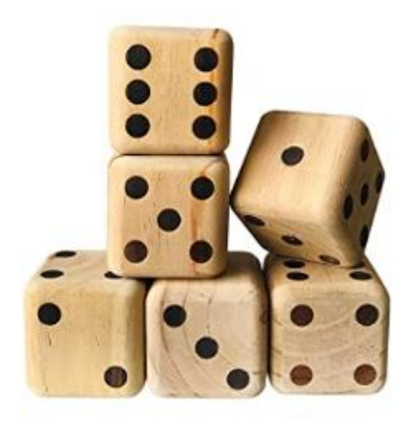
YH poker Giant Wooden Playing Yard Dice