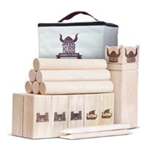
GoSports Regulation Kubb Viking Clash Toss Game Set for Kids & Adults