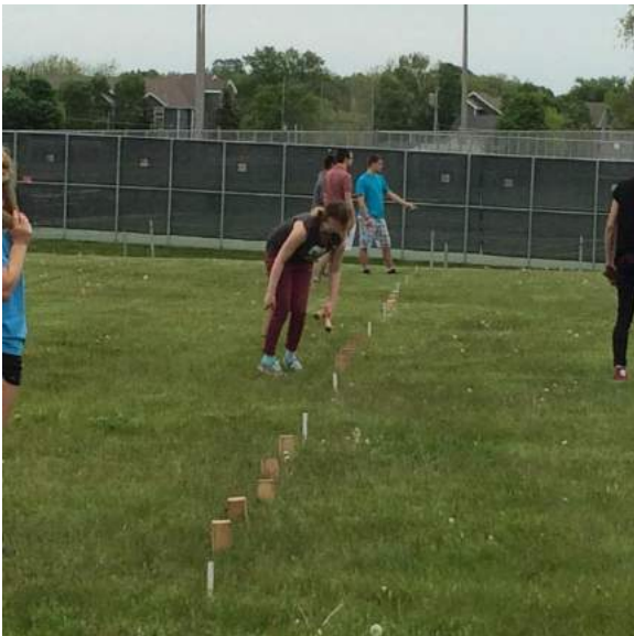
Stoughton High School students get to try their hand at Kubb during a demonstration on May 20, 2016.

Stoughton will be the host of the 2016 Stoughton Kubb Invitational which will take place on July 23 rd at John Nygaard Virgin Lake Park. The Stoughton Kubb Club along with its partner sponsors, the Sons of Norway Mandt Lodge 5-314 and the Dane County Friends of Scandinavian Culture will team up to provide a full day of Kubb learning and play for any whom may be interested. While there is a team entrance fee of $40 per team (two to six players per team), kid teams of 12 years and younger can play for free. Registration for the event will take place on the day of the event starting at 8:00 a.m. until 8:45 a.m. Come participate and help spread the fellowship of Kubb. All proceeds will go to local charities. You can find out more about the Stoughton Kubb Club or the upcoming Kubb Invitational by looking for the flyers posted all over town, or by finding them on Facebook at: