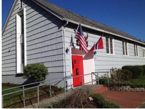
Columbia Lodge 2-058, Vancouver, WA