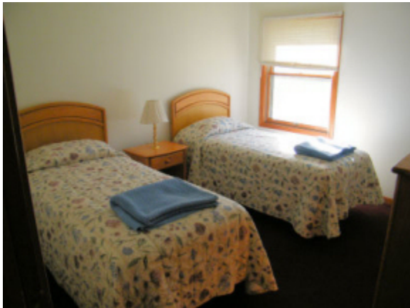
Beech room (Robin and Sandpiper are similar)