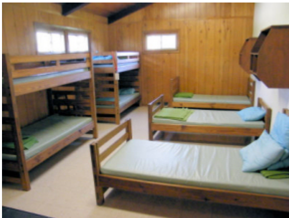
Village dorm room