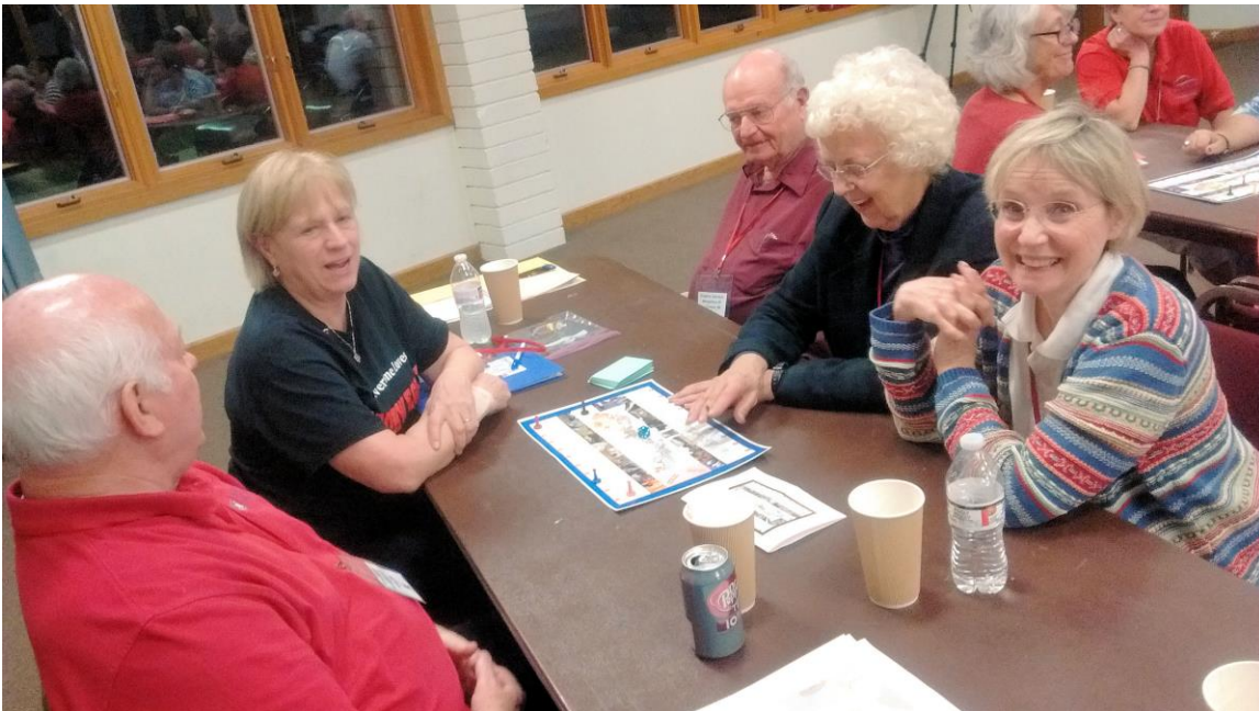
Attendees from 2017, playing the "Who Me" game and sharing their Scandinavian experiences.

The conference cost is $320 per person, which includes a two-night stay (double occupancy, with a bathroom per room), five meals and snacks. Single occupancy is $480. If you stay off campus, cost is $180. The "off campus" is set by Cedar Lake Ministries, and includes all five meals and use of their facilities. They don't have a "per meal" program.