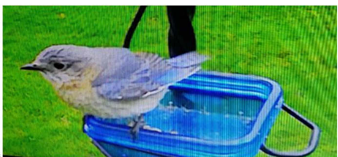
Eastern bluebird-female, Sialia sialis