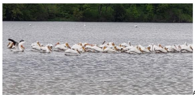
American White Pelicans, Pelecanus onocrotalus on a lake in Madison, WI