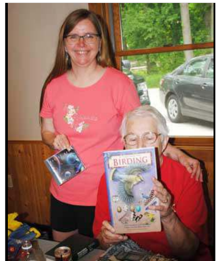
"A bird book bought by 2 cuckoos!" (that's a quote!..Anne)