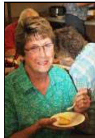
A lady of good taste!