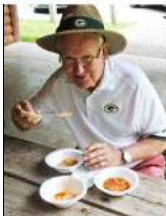
Narrowing it down to 3?