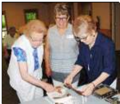
Shopping for a deal