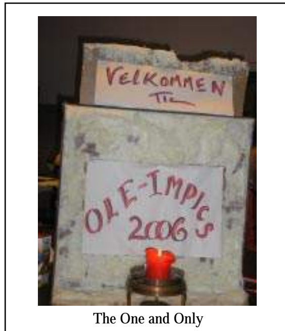
The One and Only

The Olympic flame is lit by the sun's rays using a parabolic mirror and a fuel-filled torch. If a torch goes out, it is relit from a back-up safety lantern that was also lit at the flame's origin in Olympia.