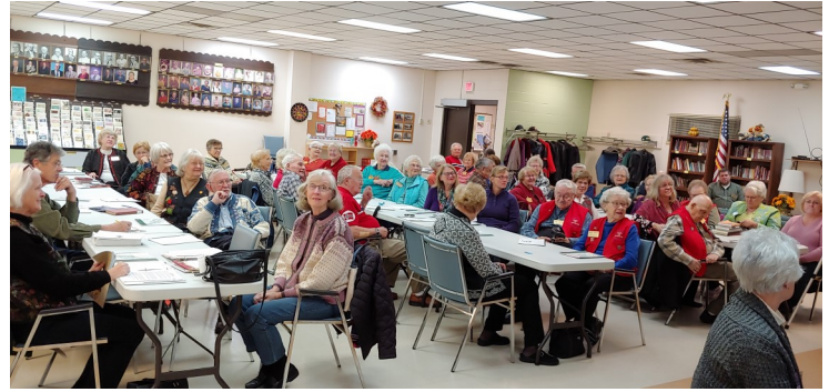
We've Moved! The November meeting was our last to be held at the Harry J. Olson Senior Center (above).