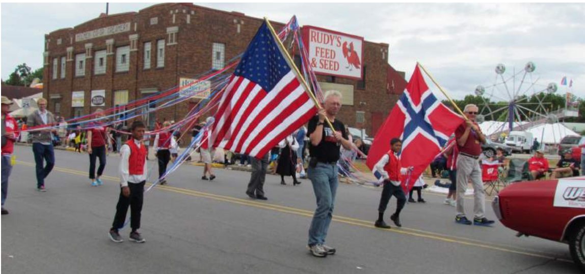
Wergeland members carrying the May pole round out our parade entry. Tusen takk to all who participated.