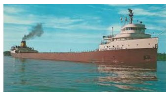
November 10, 1975: May you and the crew always rest in peace Big Fitz.

In a musty old hall in Detroit they prayed In the maritime sailors' cathedral The church bell chimed 'til it rang twenty-nine times For each man on the Edmund Fitzgerald The legend lives on from the Chippewa on down Of the big lake they called Gitche Gumee Superior, they said, never gives up her dead When the gales of November come early