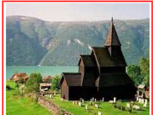
Urnes Stavkirke, Oldest in Norway

“We must either find a way to protect the wood. Or we have to set up breeding crates for the bats.” Perhaps they would rather live there,” says Ellewsen.