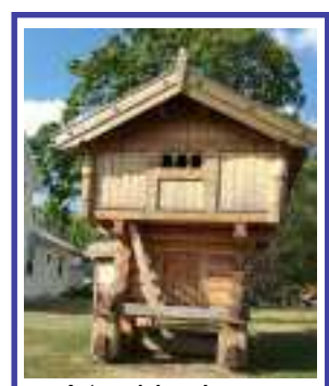
A 'stabbur' ~ A storage area elevated from snow and varmits.

A Long Day and a Long Ride, but so little time to take in all the shops and learn some of the stories behind Those Trolls! Next time!