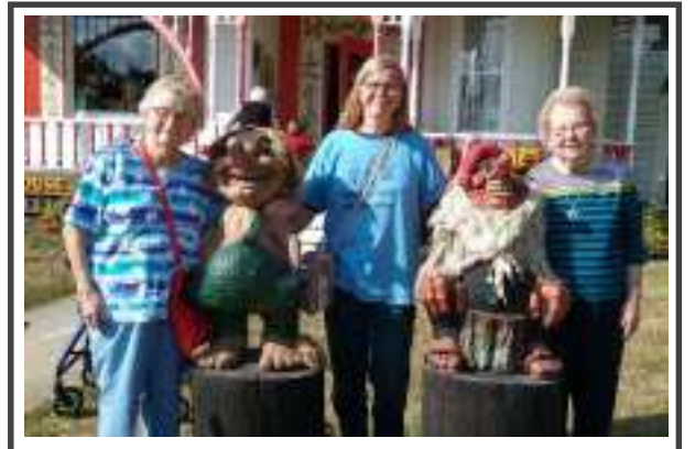
These three found some new friends!

A Long Day and a Long Ride, but so little time to take in all the shops and learn some of the stories behind Those Trolls! Next time!