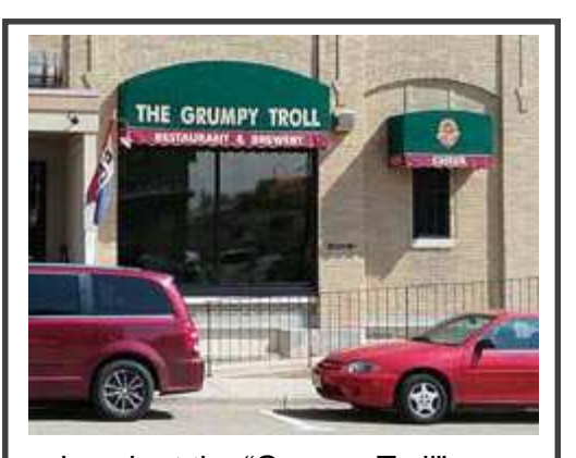
Lunch at the "Grumpy Troll"