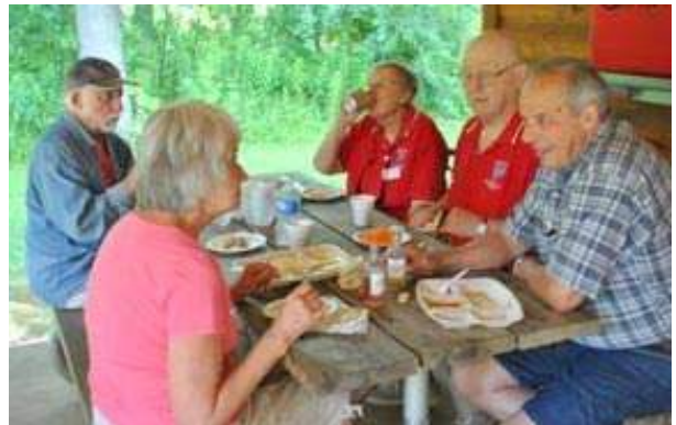
The food was plentiful!