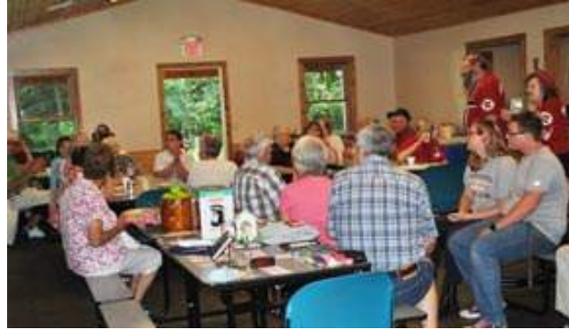
The meeting comes to order.