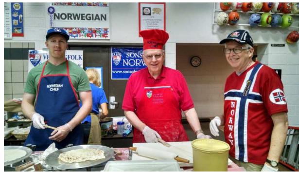
Lefse makers at Portage County Cultural Fest