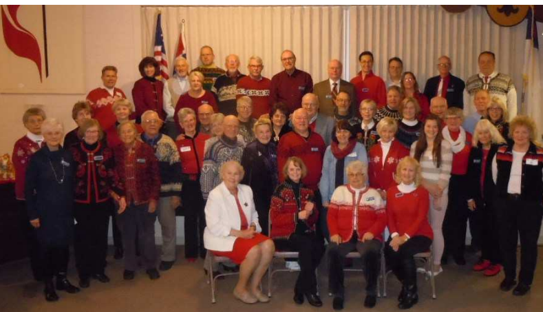
Fifty members and friends enjoyed Julefest