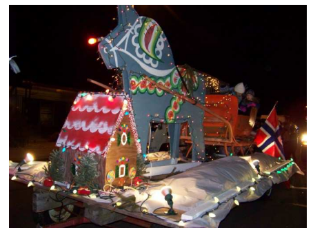
Vennligfolk's Dala Hest in Christmas Parade