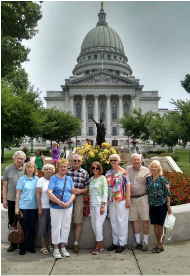
Day trip to Madison, Wisconsin