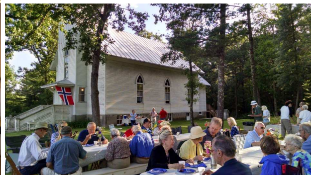
Midtsommer at historic South New Hope Church