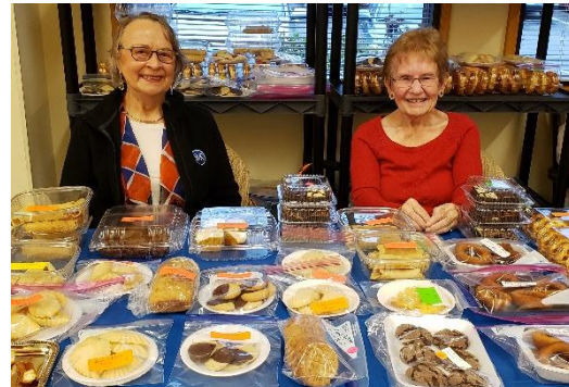
There were lots of goodies for sale