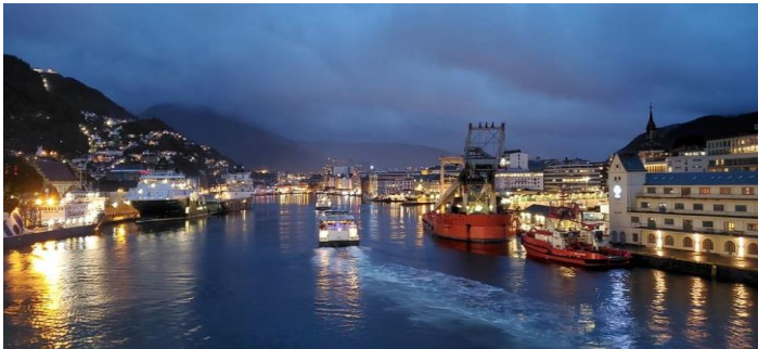
Bergen Harbor, Norway (Sept. 2019)

Place the salad in a serving bowl, garnish with the pomegranate seeds and serve. (Serves 4)