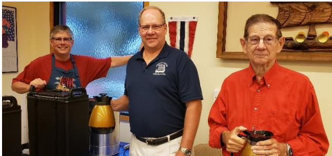
Who wants a good cup of Norwegian coffee?