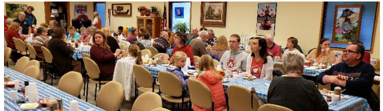
Frokost brought smiles to all!