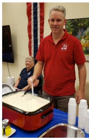
Lefse and Smørgrot were served with pride.