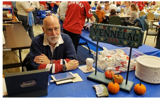
WELCOME TO FROKOST!