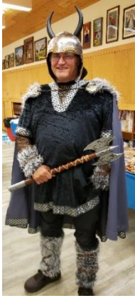
Vennelag's Viking greeted our guests.