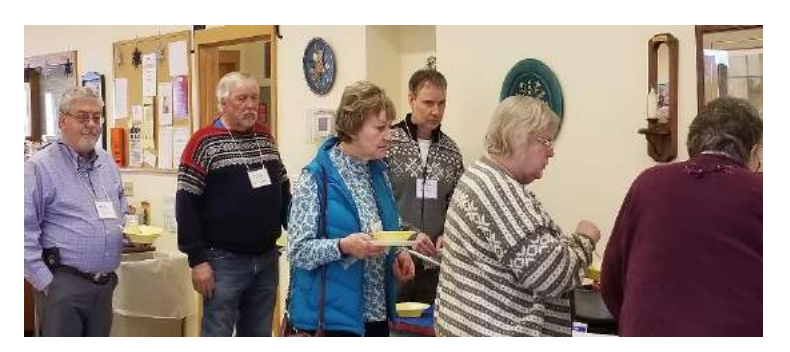
Our Vennelag TasteTesters! Finding the most palate-pleasing chili and voting with BEANS! Followed by our Euchre tournament.