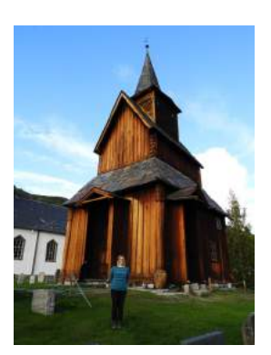
November December 2017