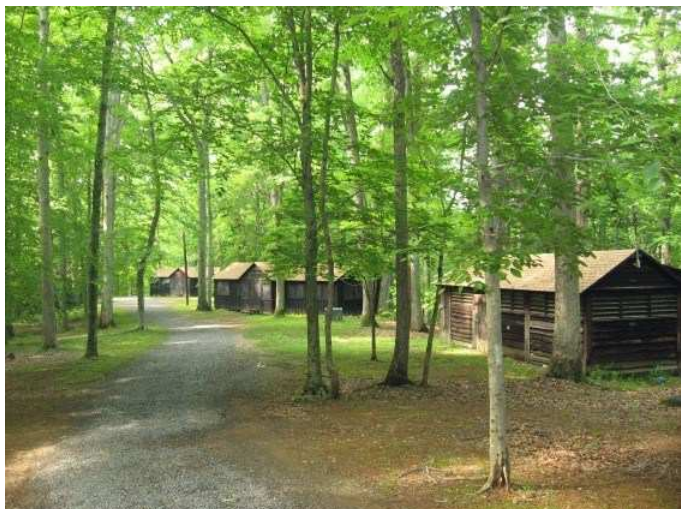
Masse Moro Camp near Eau Claire, WI.