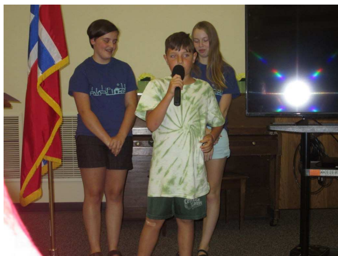
The three campers tell us all about Masse Moro!