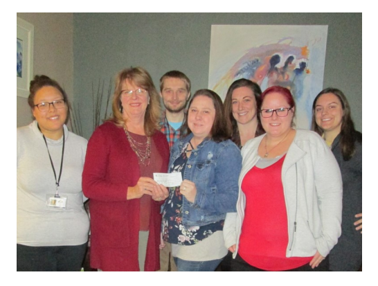
The staff at The Bridge To Hope