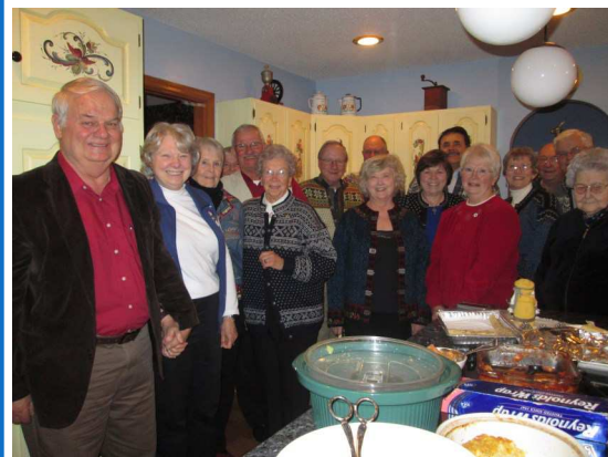
Lining up to enjoy a delicious pot luck Christmas Party at the Lestruds.