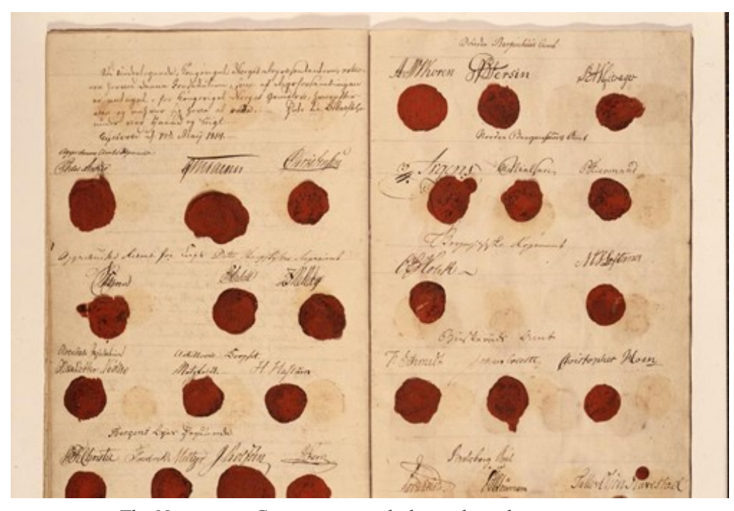
The Norwegian Constitution with the seals and signatures.

The two countries were loosely joined, each having its own constitution, but the two being united under one king. This arrangement lasted throughout the nineteenth century, because of the moderation and prudence of the rulers, but the interests of the two peoples were incompatible and divergent. The Swedish kings always desired to make their state stronger by bringing about a closer union of the two countries, and having the two peoples cherish the same interests in common; the people of Norway, with different ideas and desires, wished that there were no union at all, and strove to have it made looser. Sweden was larger and more populous, but while there was more wealth in the country, wealth and power were concentrated in the hands of nobles and aristocracy, leaving the mass of the people without property or political power. The government was vested entirely in the hands of the king, checked, when at all, only by an assembly of estates, something like those which had disappeared in England and Spain long before, and like those which had been resurrected in France in 1789.