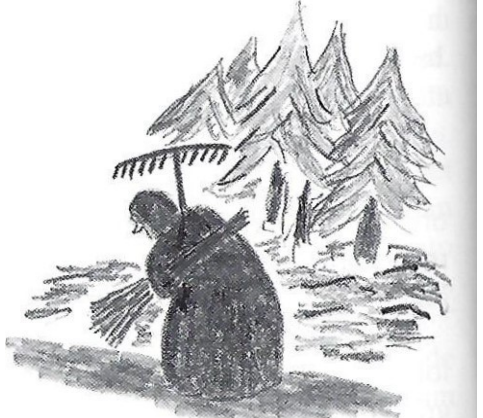
Han feiede Landet og gjorde det tom, der blev ikke mange tilbage.

fatality rate from this disease in Norway may have been as high as 1/3 to 1/2 of the population. Many farms were abandoned among them was the Tærud farm in Telemark from where my mother's ancestors immigrated . Tærud was listed under a larger farm in the area for the next 300 years!