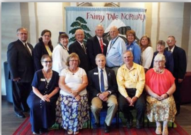
2016-2018 District 5 Board Members