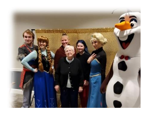
Tusen Takk! Once Upon a Dream Of Rockford