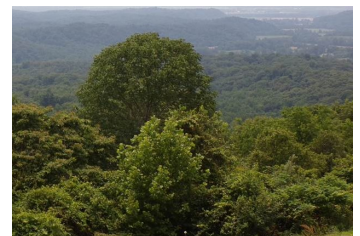
The Shawnee Forest

sented a total “knock out” program on Julebukking in Scandinavia! Julebukking is a tradition where people wearing masks and costumes go door to door, while their neighbors attempt to