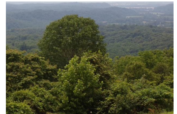
The Shawnee Forest