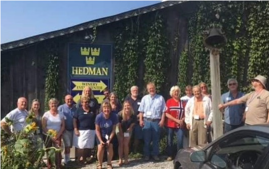
Aug. 26, 2018 Lodge meeting