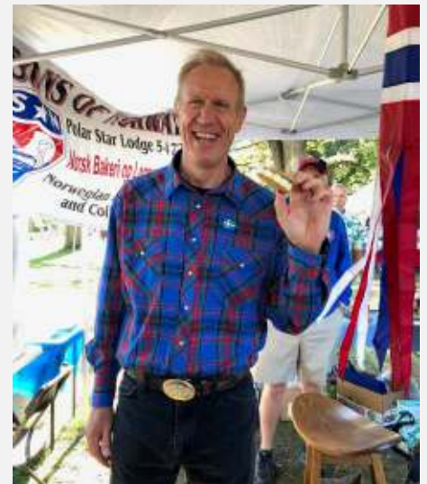
Governor Rauner enjoying Peppersmåkake with iskrem at our Polar Star Bakeri