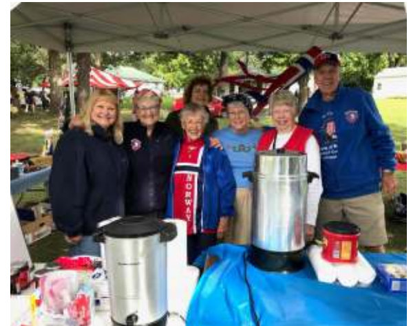
Polar Star workers at Vasa Park