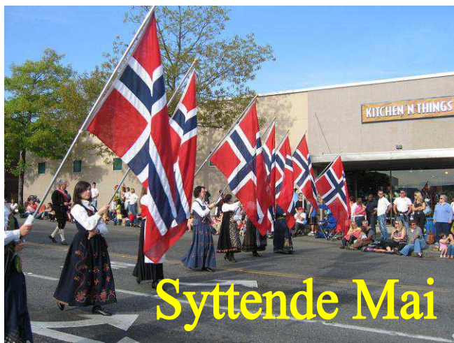
A Norwegian Constitution Day celebration in the Ballard area of Seattle, Washington.