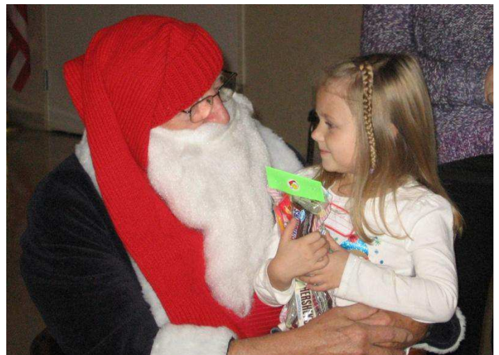
THE JULENISSEN VISITING THE CHILDREN