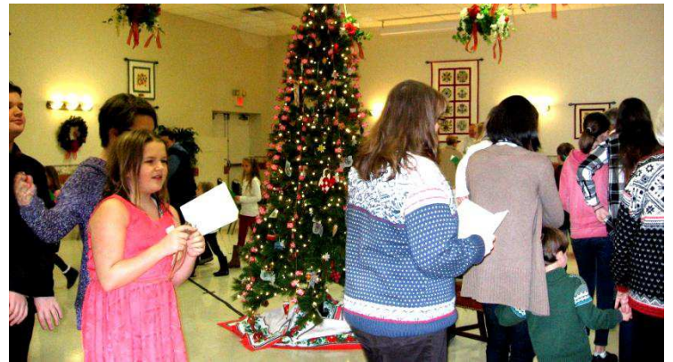
SINGING & MARCHING AROUND THE CHRISTMAS TREE