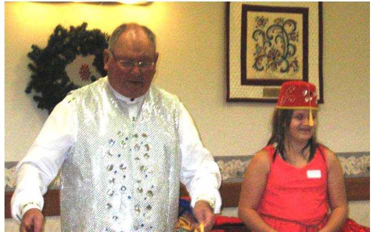
CHILDREN'S ENTERTAINMENT, "MR. FUN", THE MAGICIAN